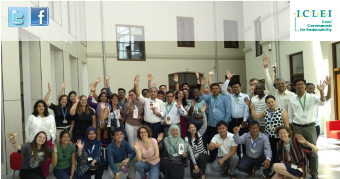
ICLEI South Asia E-News

Forward this message to a friend | Click to view this email in a browser