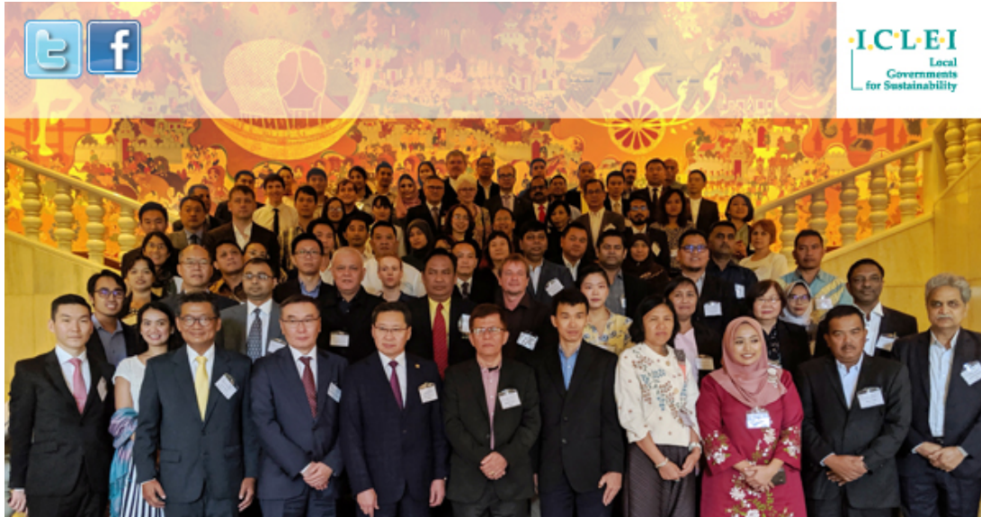
ICLEI South Asia E-News

Forward this message to a friend | Click to view this email in a browser