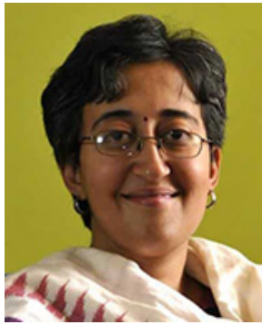
Ms. Atishi Marlana