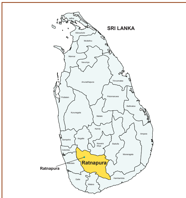
Figure 1: Location of Ratnapura in Sri Lanka

Ratnapura is a major city in Sri Lanka. It is the capital city of Ratnapura district, Sabaragamuwa Province (refer Figure 1). The city is 21m above sea level and has a population density of 2,474/km 2 . The city is known for the long-established industry of precious stone mining, including rubies, sapphires, and other