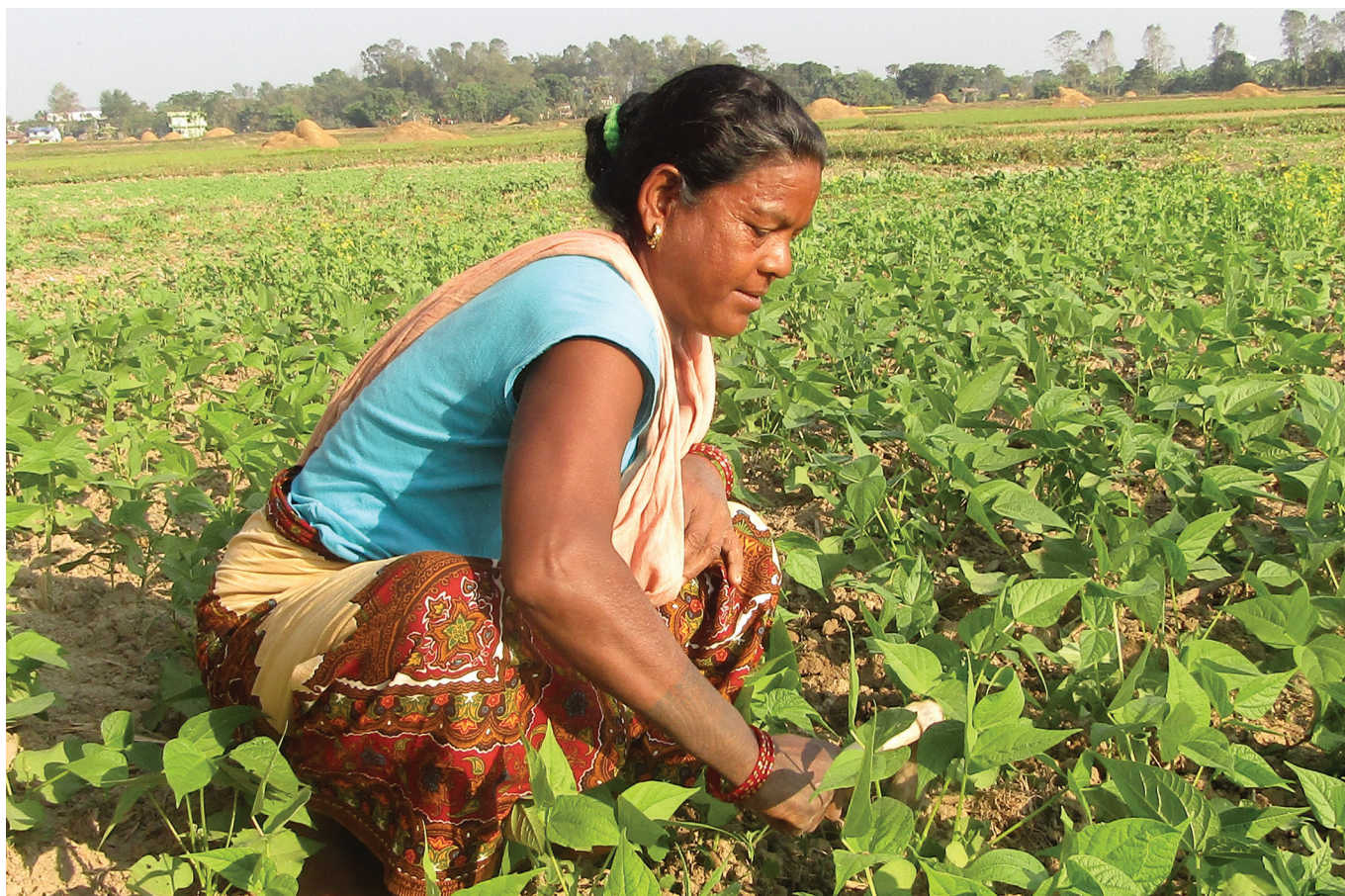
Women in agriculture field, Agyauli village, Nepal.

are categorised as ‘directly gender-responsive’ (impacting more than 50% of women), ‘indirectly gender-responsive’ (impacting 20% to 50% of women) and ‘neutral’ (impacting less than 20% of women). 13 Gender budget coding is used based on the following five indicators: