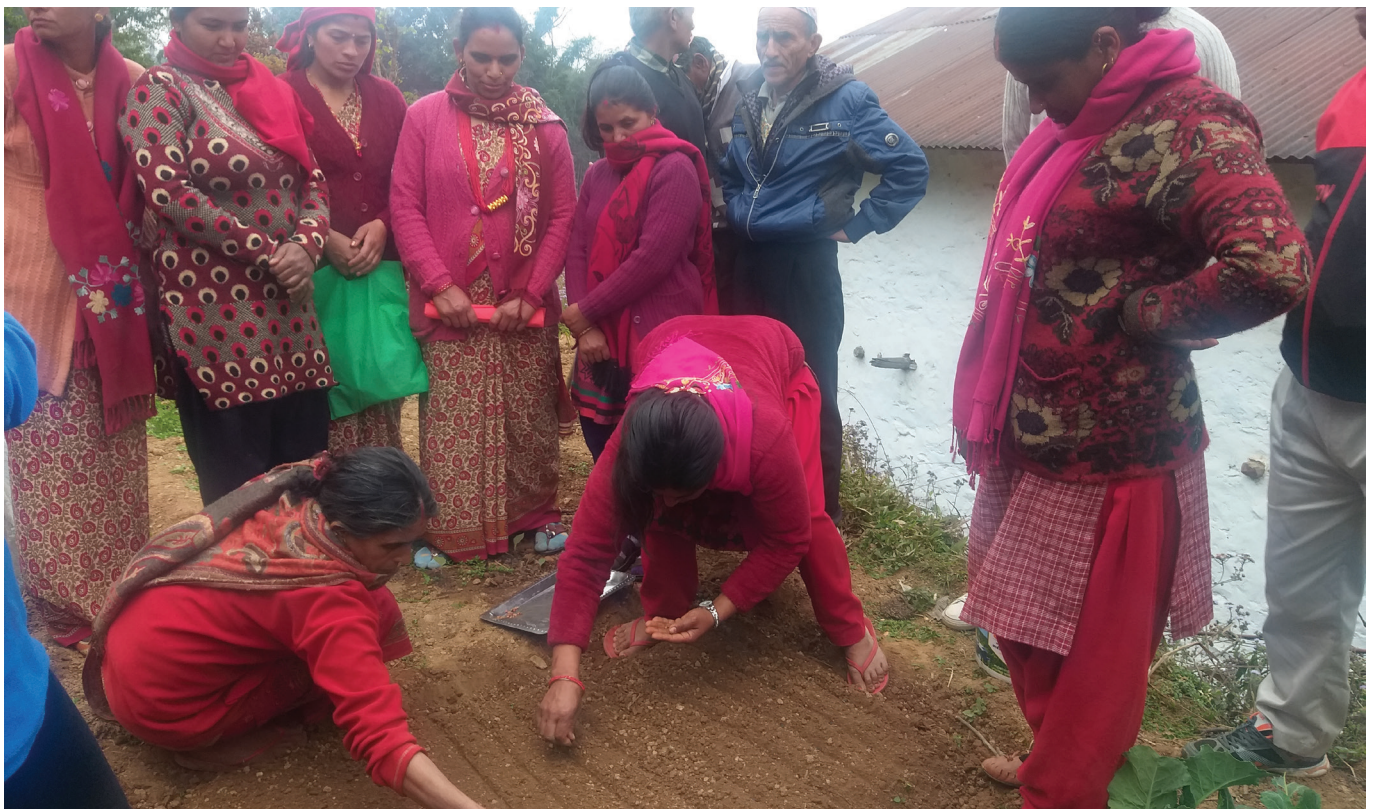
Women farmers teaching sowing techniques to other in Tallo Kudule village, Nepal.